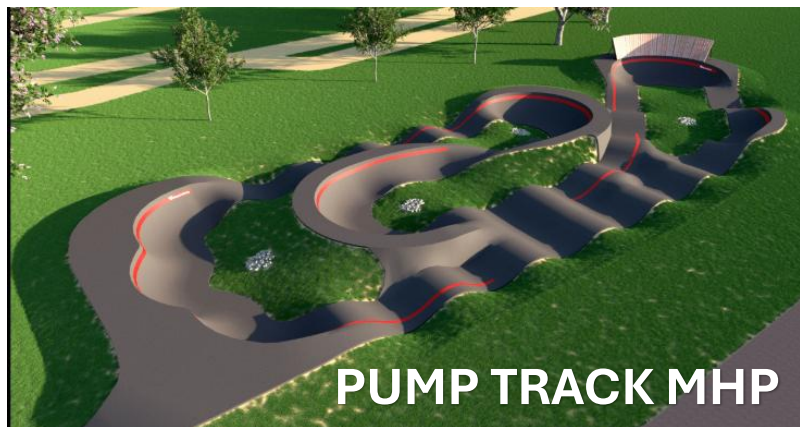
PUMP TRACK MHP