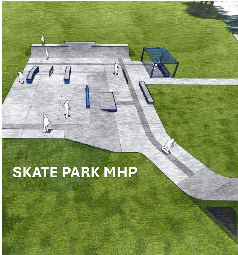
SKATE PARK MHP