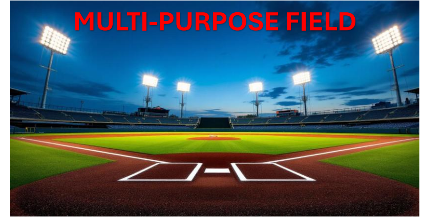
LIGHTS AT CARVER REC MULTI-PURPOSE FIELD