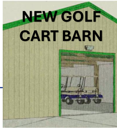
NEW GOLF CART BARN