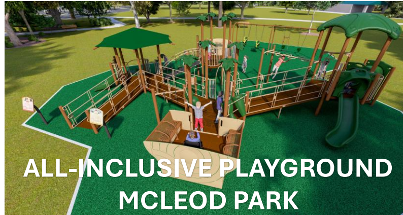
ALL-INCLUSIVE PLAYGROUND MCLEOD PARK